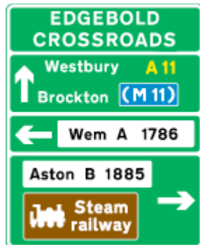
Seen on approaches to junctions