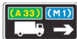
Advisory route for lorries