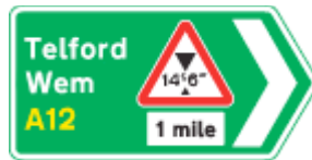
Seen at the junction