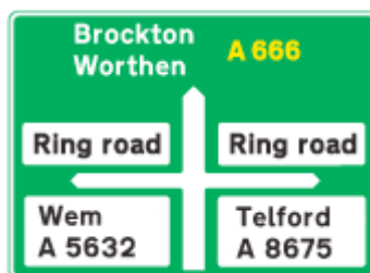
Primary route forming part of a ring road

SIGNS ON NON-PRIMARY AND LOCAL ROUTES - BLACK BORDER