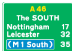
Route confirmatory sign after junction