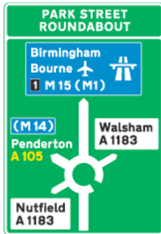
Seen on approaches to Junctions